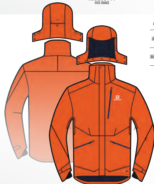
L.38318600 VIVID ORANGE