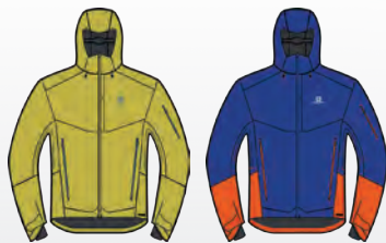
L.38235200 ALPHA YELLOW

LINING Inner media pocket • Inner stash pocket • Goggle mesh pocket • INSULATION Primaloft® 40g / m 2 • HOOD Fixed Hood • Hood With 3D Adjustment • Helmet compatible hood • SLEEVE Articulated sleeves • Efficient moisture wicking «advanced skin active dry» cuff with thumb loop • Cuff Tabs • BODY • SLEEVE Goggle wipe • High collar • Air vent system with mesh backing • Powderskirt • HEM Hem adjustment • POCKETS Left arm lift pass pocket • 2 hand zipped pockets • 1 chest pocket • SEAMS 100% taped • ZIP Waterproof zip • COMPOSITION BODY: RECYCLED PES 100% • LINING: PES 100% • LINING INSERT: PES 100% • PADDING: PES 100% • SLEEVE INSERT: PA 100%