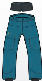
L.38235800 BLUE STEEL

LINING Breathable Fully Closed Mesh Lining • WAISTBAND Waist adjustment • Removable stretch powderskirt • LEG Inner leg air-vents with mesh backing • External leg air-vents with mesh backing • Bottom leg zipper • BODY Air vent system with mesh backing • POCKETS 2 hand zipped pockets • 1 chest pocket • 1 cargo pocket • SEAMS 100% taped • COMPOSITION BIB: PA 86%, EL 14% • BOTTOM: RECYCLED PES 100% • LINING: PES 100% • LINING INSERT: PES 100%